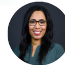
Moderator: Tunya Smith Director of the NC Department of Transportation's Office of Civil Rights